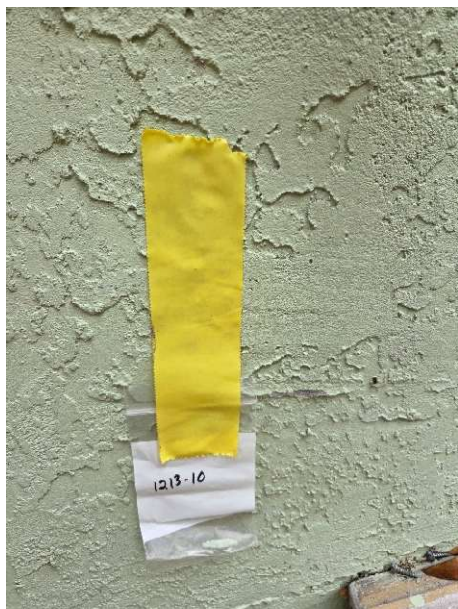
Sample 1213-10 Typical Stucco Sample