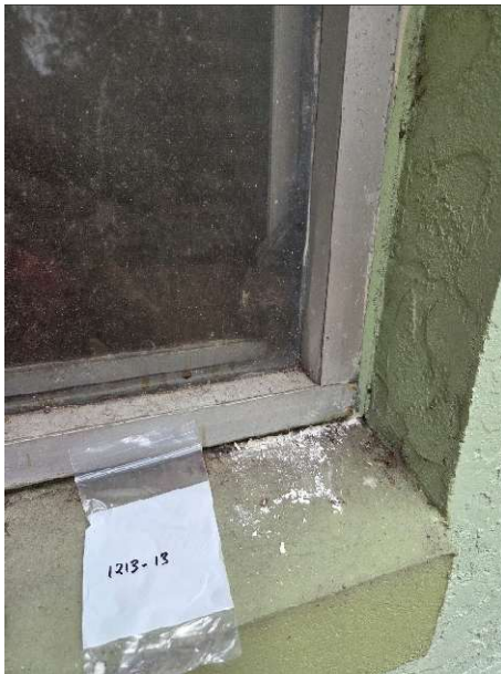
Sample 1213-13 Typical Exterior Caulking Sample