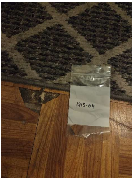
Sample 1213-04 Typical 12"x 12" Vinyl Floor Tile Sample