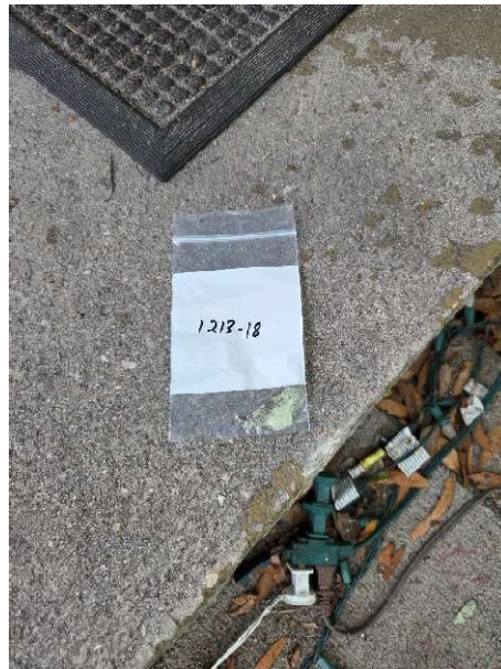
Sample 1213-18 Concrete Sample