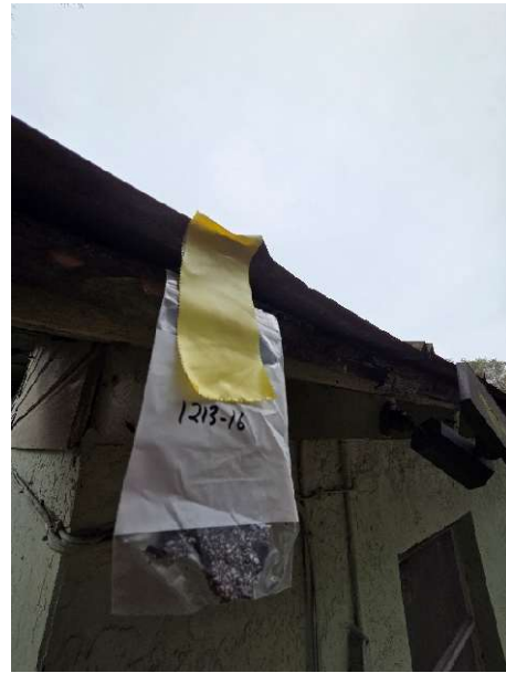
Sample 1213-16 Asphalt Roofing Sample