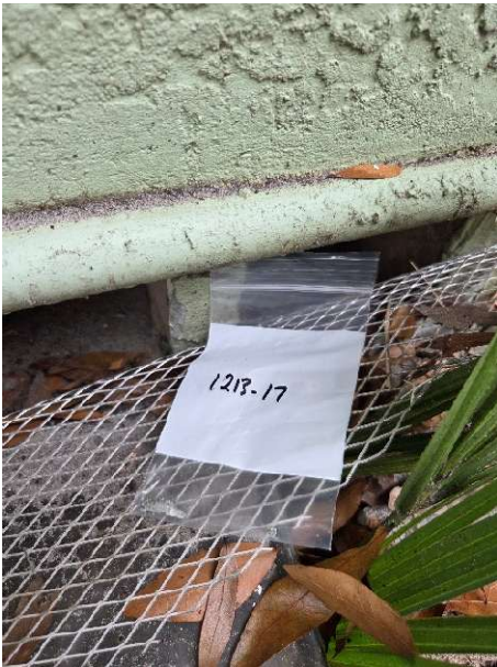
Sample 1213-17 CMU Block Sample