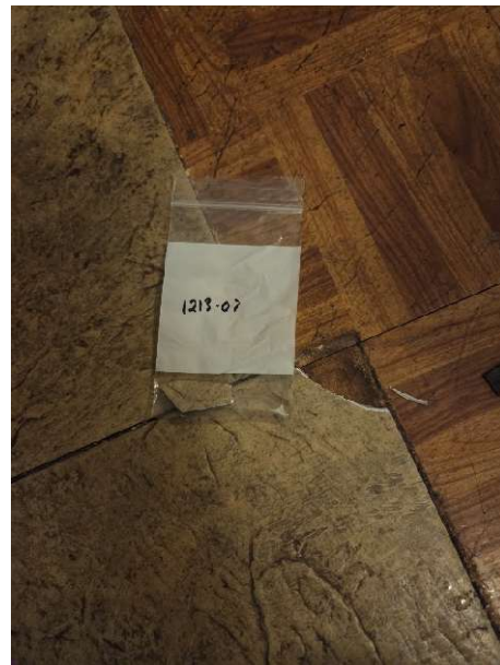
Sample 1213-07 Typical 12"x 12" Vinyl Floor Tile Sample