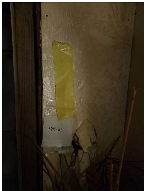
Sample 1213-01 Typical Drywall & Joint Compound Sample